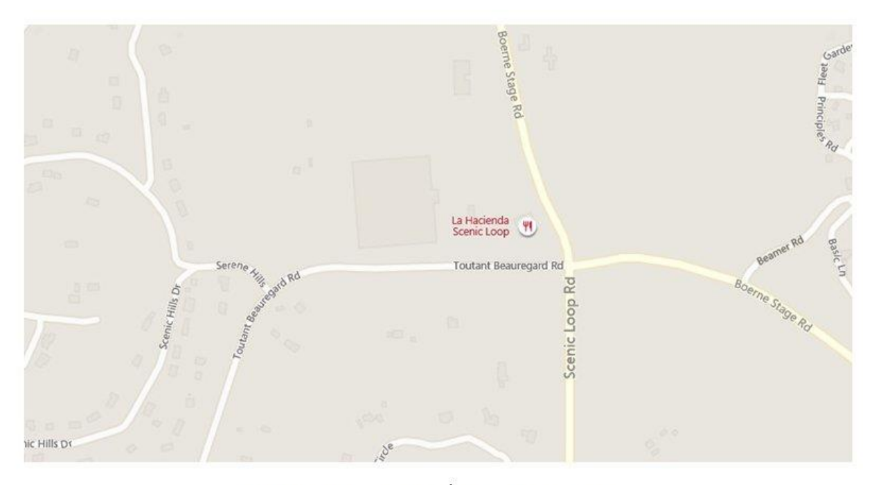
La Hacienda Scenic Loop General Location Map