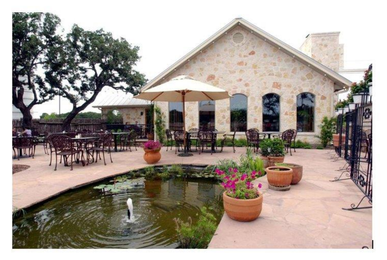
La Hacienda Scenic Loop Outdoor Scene